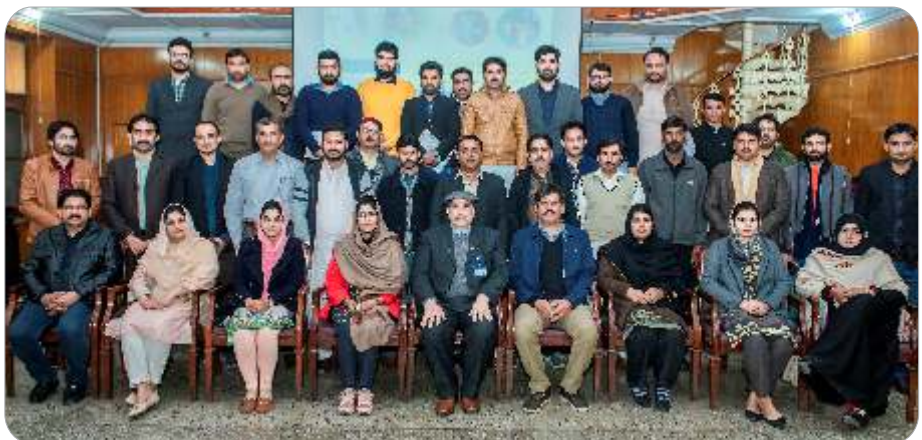
5th Farm Advisers Training Workshop participants at UVAS.