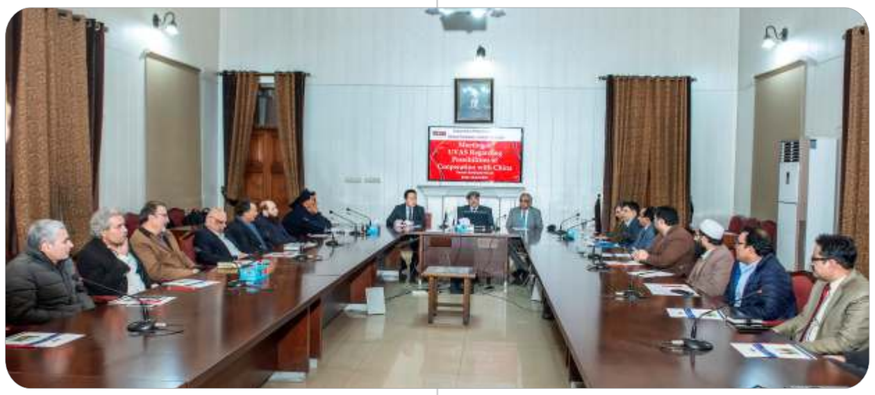
A meeting of the Chinese delegation with UVAS senior faculty members.