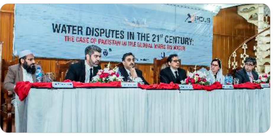
Speakers sit on stage at a seminar on Water Disputes in the 21st Century at UVAS.