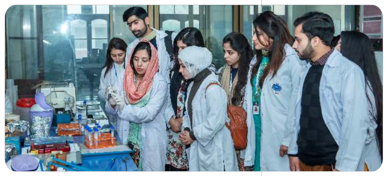
UMT Sialkot Campus students during a study tour in a UVAS lab.